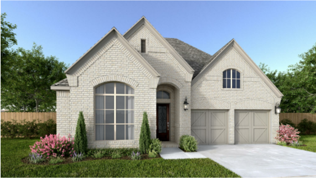
Design 404A E-1