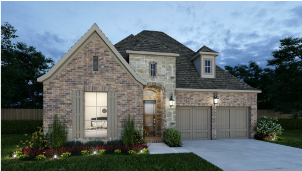
Design 404A E-70