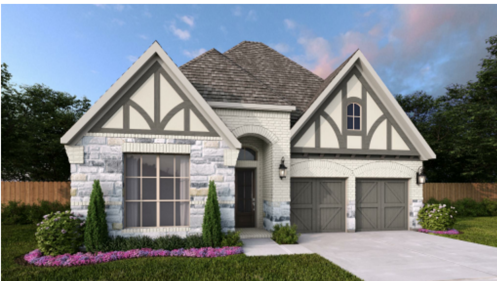
Design 404A E-90