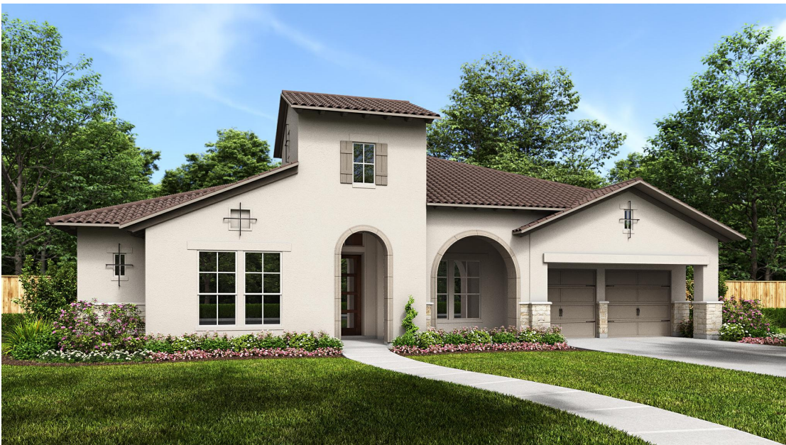
Design 617A E-103