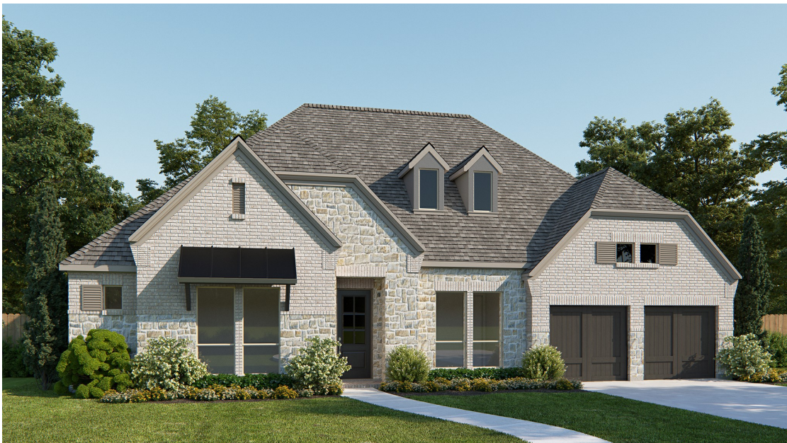
Design 617A E-53