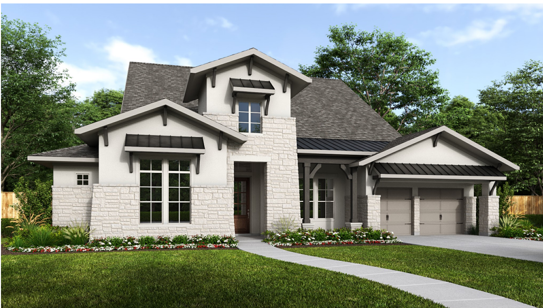
Design 617A E-104