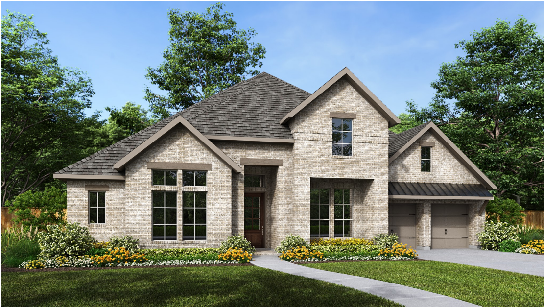
Design 617A E-1