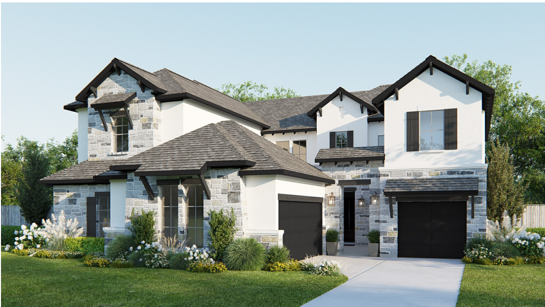
DESIGN 650A E-90