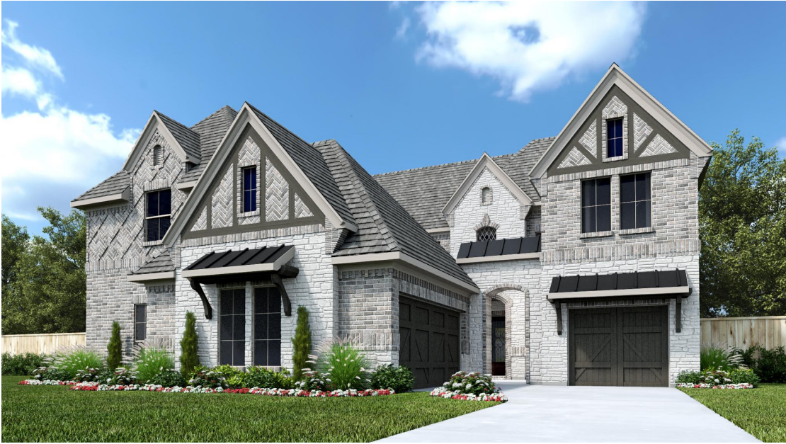
DESIGN 650A E-1