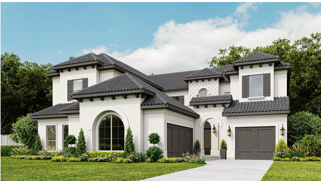
DESIGN 650A E-100