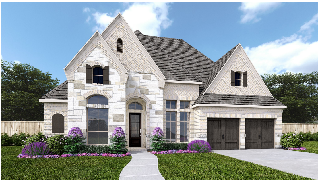
DESIGN 525A E-71