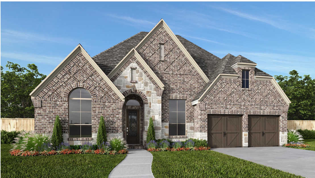
DESIGN 525A E-50