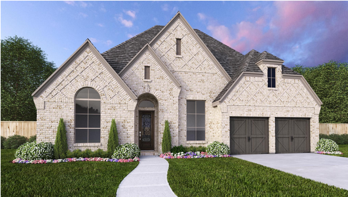
DESIGN 525A E-1