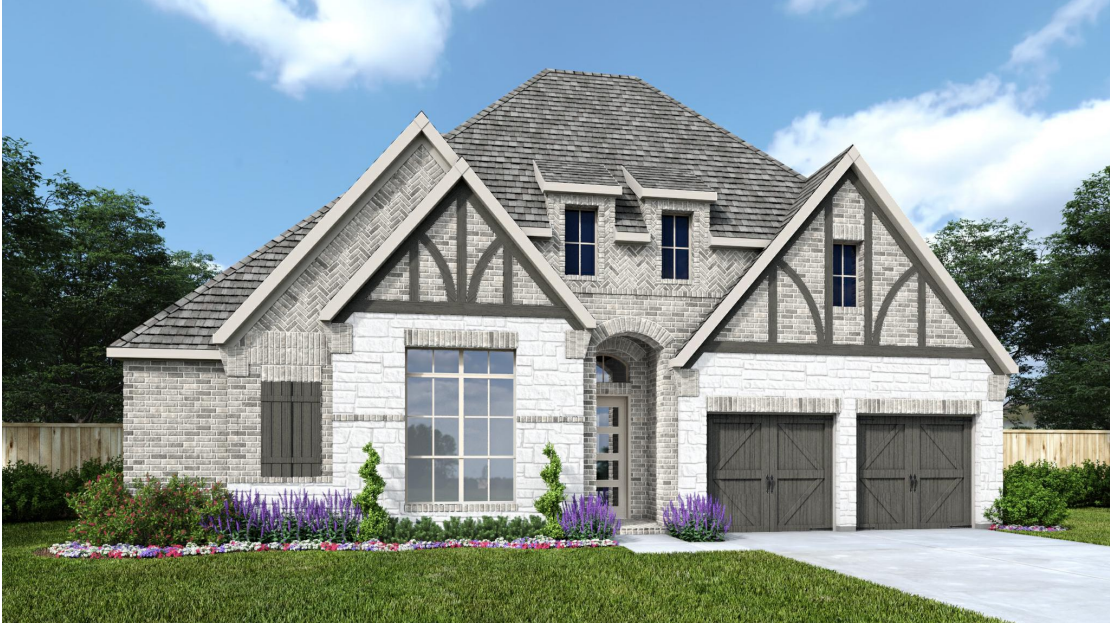
DESIGN 519A E-71