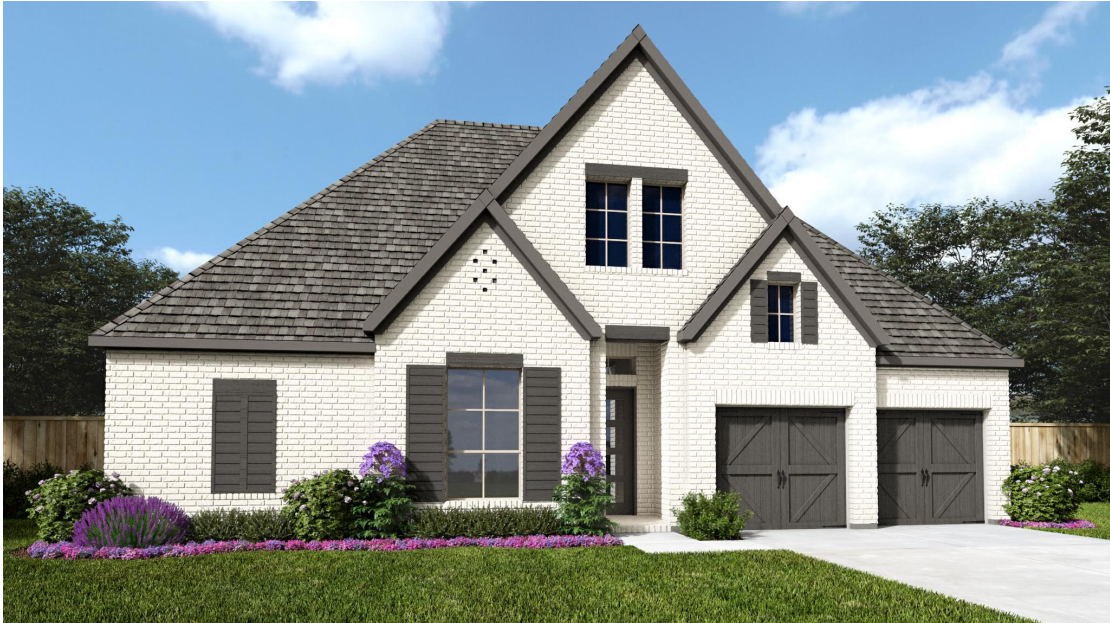
DESIGN 519A E-1