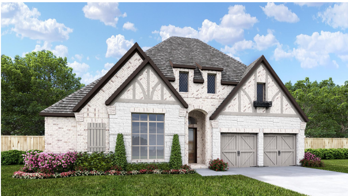
DESIGN 519A E-90

*See Elevation Page(s) for Details and Disclaimers. © Perry Homes, LLC 2023