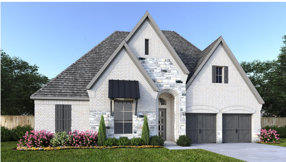
DESIGN 519A E-70

*See Elevation Page(s) for Details and Disclaimers. © Perry Homes, LLC 2023