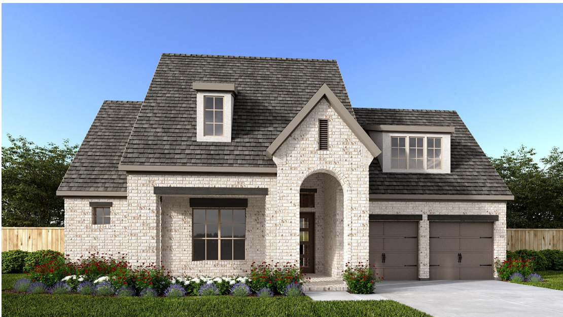
DESIGN 519A E-102