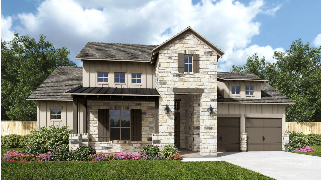
DESIGN 519A E-101