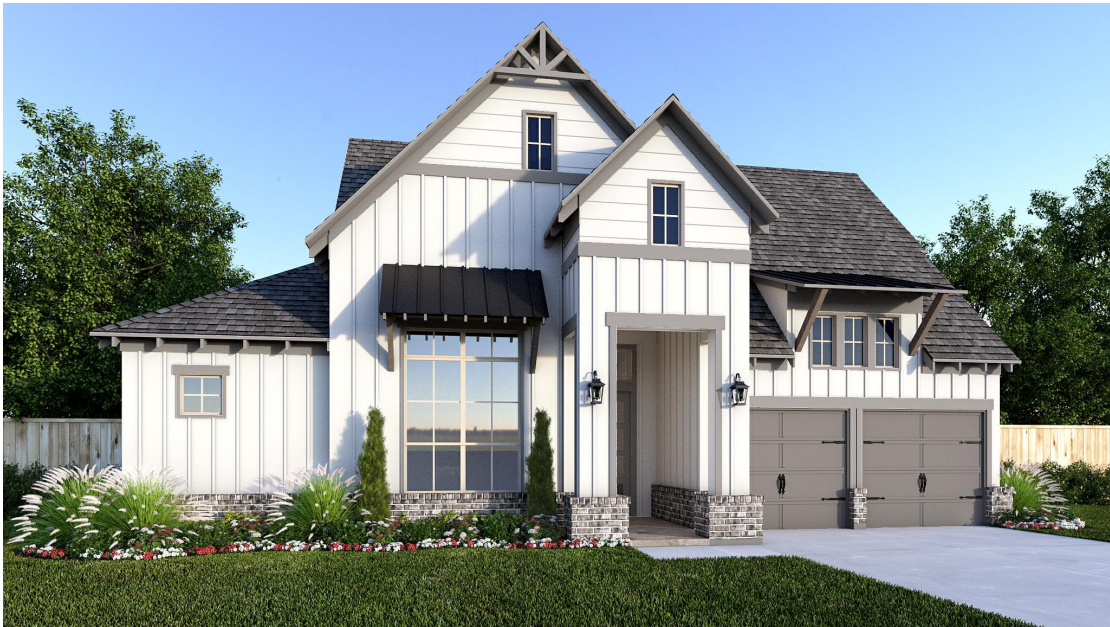
DESIGN 519A E-51