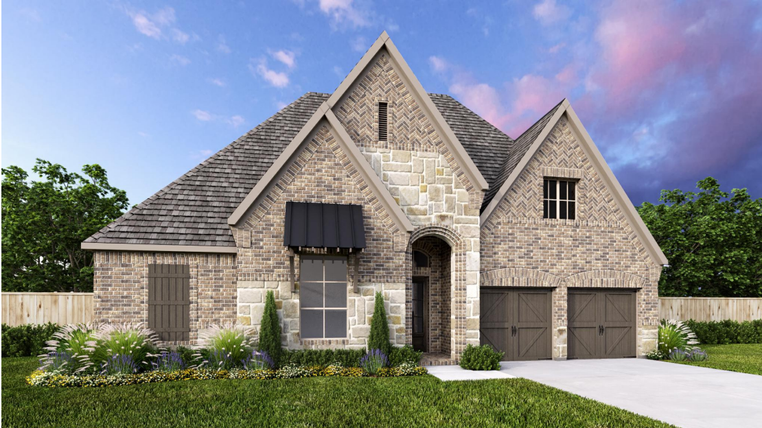
DESIGN 519A E-72