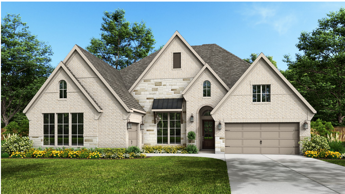
DESIGN 616A E-50