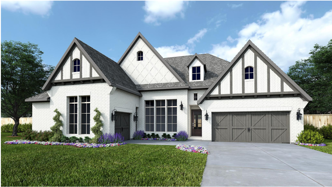
DESIGN 616A E-1