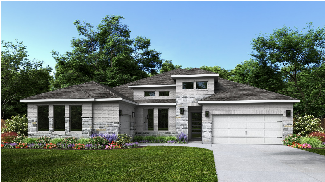
DESIGN 616A E-30