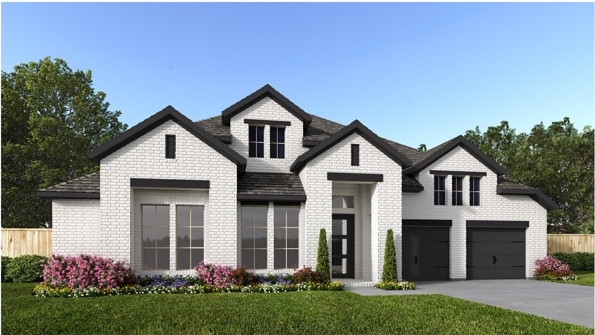
DESIGN 619A E-2