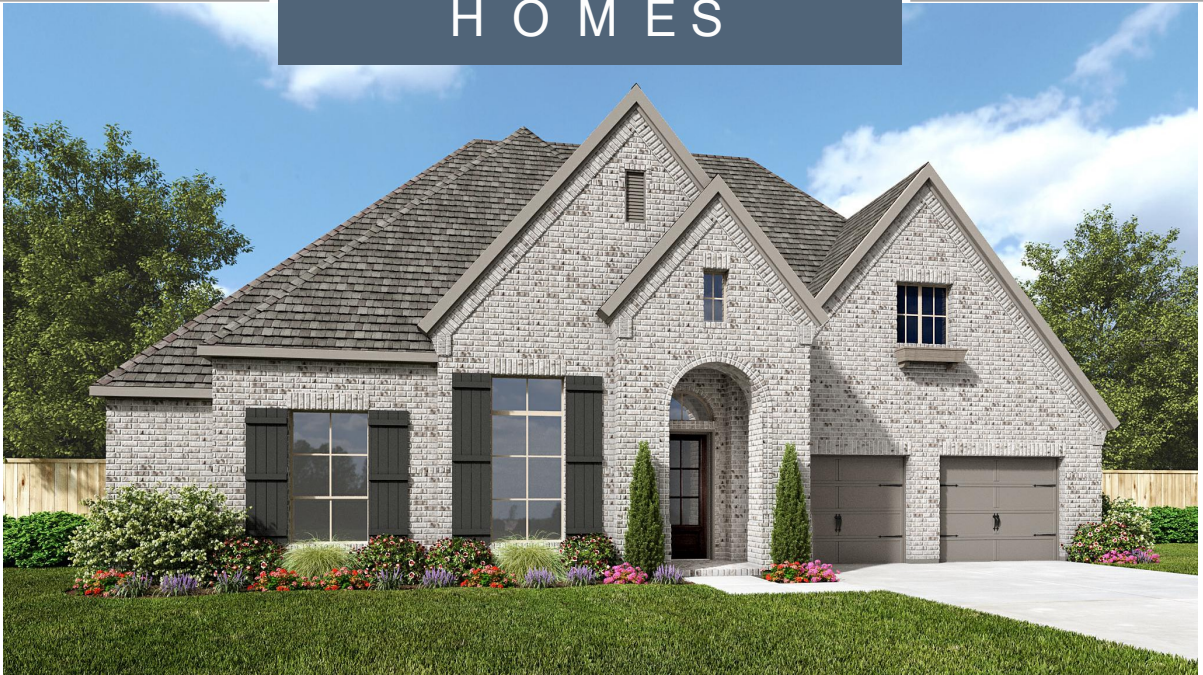
DESIGN 619A E-1